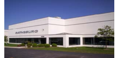
The Novi Campus At Channel University